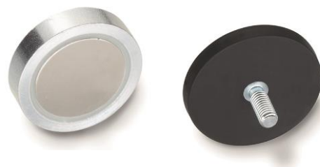
Flat magnets RMA and RMH

Product technical data sheets, along with drawings and tables with codes and dimensions are available on our website elesa.com .